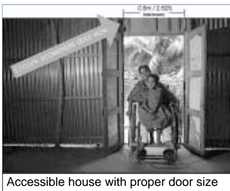
Accessible house with proper door size

Having an adequate house to live in is a key determinant of one's ability to maintain or establish livelihood activities. Simple modifications to make houses disability-friendly dur-