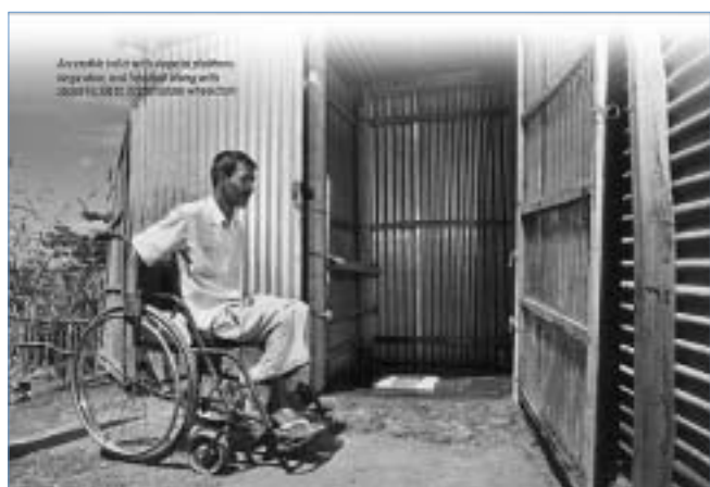
Accessible toilet with slope to platform, large door, and handrail along with space inside to accommodate wheelchair

Latrines should be designed, built and located such that they are easily accessible and can be used by anyone, including children, the elderly, pregnant women and PWDs. The following features should be considered: