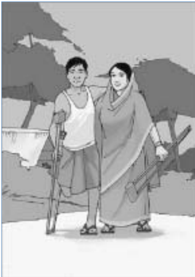
Helping a person with disability, to go faster; do not forget to bring the assistive devices.

Disability is more often not an integral part of emergency situations, and yet it is not taken into account by most of the players in the rush during an emergency, natural or human-made. "There are no disabled people, we didn't see them", is what we hear too often when discussing with the various local and international NGOs and public actors involved. And yet we