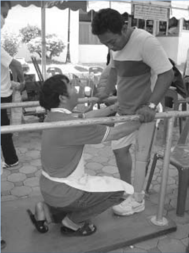
Die Patienten der mobilen Orthopädistation erhalten dringend benötigte Hilfsmittel

anfälligsten und verletzlichsten sind, besondere Aufmerksamkeit zu schenken – auch wenn es Minderheiten in der betroffenen Bevölkerung sind. Als besonders anfällige und gefährdete Gruppen gelten bereits seit langem Kinder, Schwangere und stillende Mütter, alte Menschen, Kranke und Verletzte. In den letzten Jahren hat sich mehr und mehr die Erkenntnis durchgesetzt, dass auch chronisch Kranke und Menschen mit psychischen oder psychiatrischen Krankheitsbildern im Rahmen von international anerkannten Standards und Richtlinien in diese Kategorie eingestuft werden müssen. Eindeutig gefordert wird auch die Berücksichtigung von Menschen mit Behinderungen und deren besondere Bedürfnisse in die Planung und Durchführung der humanitären Hilfe. Diese Forderung ist in den Sphere-Standards bereits aufgegriffen worden und wird als Empfehlung an Hilfsorganisationen explizit formuliert.