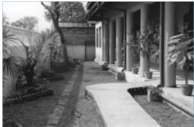
Behindertengerechte Neuausstattung und Renovierung des Sambodhi

Im Sambodhi Home , das ebenfalls im Distrikt Galle liegt, lebten vor dem Tsunami über 110 Menschen mit körperlichen und geistigen Behinderungen zusammen, 48 von ihnen kamen durch die Flutwelle um. Für viele von ihnen ist das Heim zu einem neuen zu Hause geworden, obwohl sie mit entsprechender Hilfe vielleicht auch in der Lage wären, ein eigenständiges Leben zu führen. Auch diese Tatsache ist ein Hinweis darauf, dass die Integration von Menschen mit Behinderung in die Gesellschaft von Entwicklungsländern ein