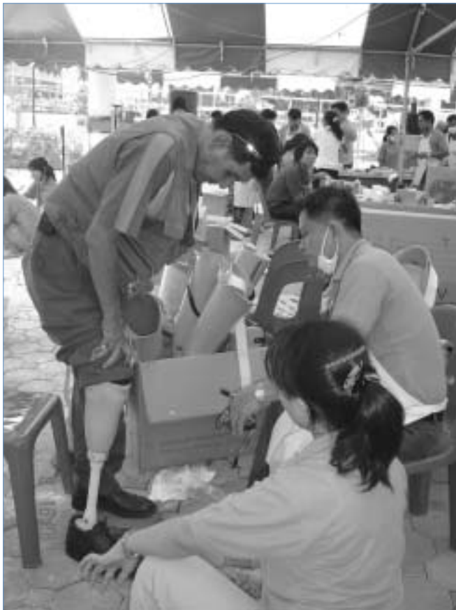
Die Prothesen werden individuell für die Patienten angepasst

Ausbildung und die tägliche Arbeit von humanitären Helfern eingebunden ist. Darüber hinaus hilft Sphere , das Bewusstsein für die Problematik zu stärken und gibt Anregungen für die Katastrophenvorbeugung und die Vorbereitung auf Krisen und Katastrophen.