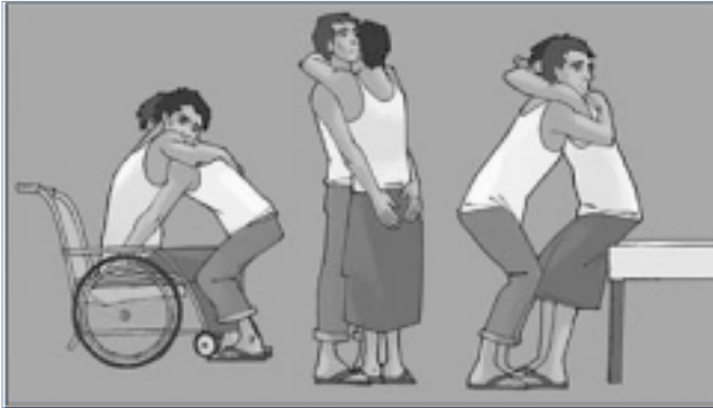
One person transfer: This transfer is for person(s) who can put weight on their legs but are not able to move without some help.

services before the disaster, it is important to continue these services as soon as possible after the disaster to ensure the persons' progress does not deteriorate. In many cases, it takes weeks or months to improve, but only days to deteriorate. While in some cases, specially trained professional staff are needed to work with certain PWDs, in other cases, primary rehabilitation activities can be carried out by staff of community organizations following basic training or by local disability resource persons. The role of these community-based workers is to train the individual and his/her family to be able to carry out rehabilitation activities (such as basic exercises to increase movement of a stiff limb or prevent a limb that does not move very much from becoming tight and developing a deformity), provide regular follow-up, and refer PWDs to appropriate resources in the community for specialized care (e.g. physiotherapy or orthopedic surgeon) or other services (vocational training, schools, etc).